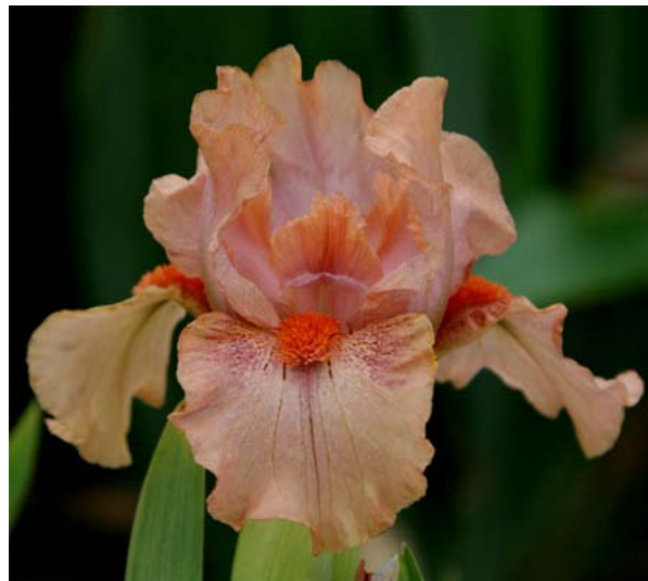
ignite (Black 09)

Bright yellow with rusty chestnut spot. Showy clumps. $5.00