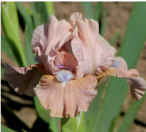
warm and fuzzy (T.Johnson10) Muted peach and tan peach bitone. Peach pink styles. Cute tangerine to light blue beards. Very pleasant. $6.00