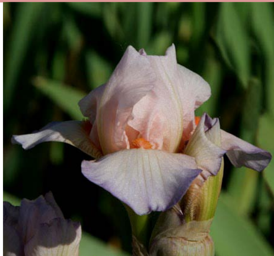
tic tac toe (T.Johnson 10)

Cinnamon standards. Garnet falls boldly striped white. Top AM 2010. Outstanding! $4.00