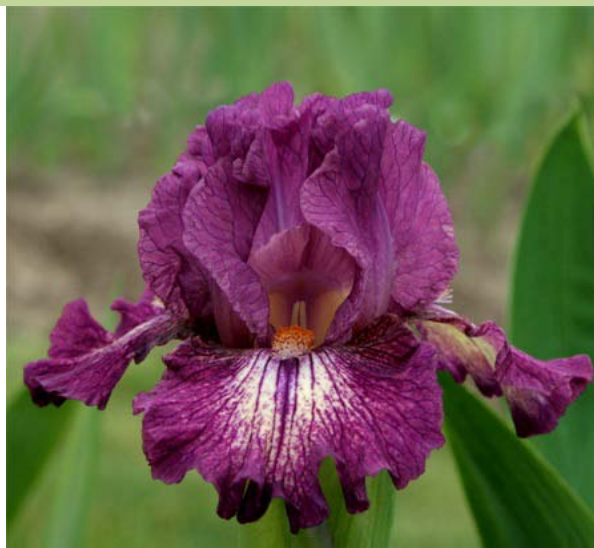
cat in the hat (Black 09) Raspberry rose and white plicata. Super show branching & buds. Vigorous growth. Fertile $7.00