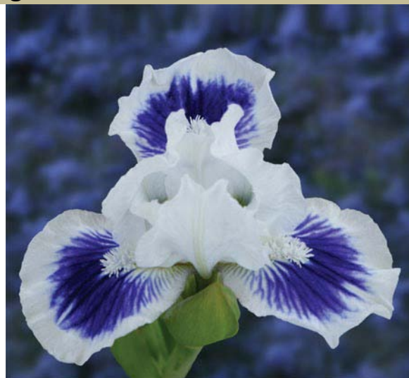
open your eyes (Black 10) An unforgettably bright display. Spot is inky dark blue rather than the more common red purple spots. Commands attention. $6.00