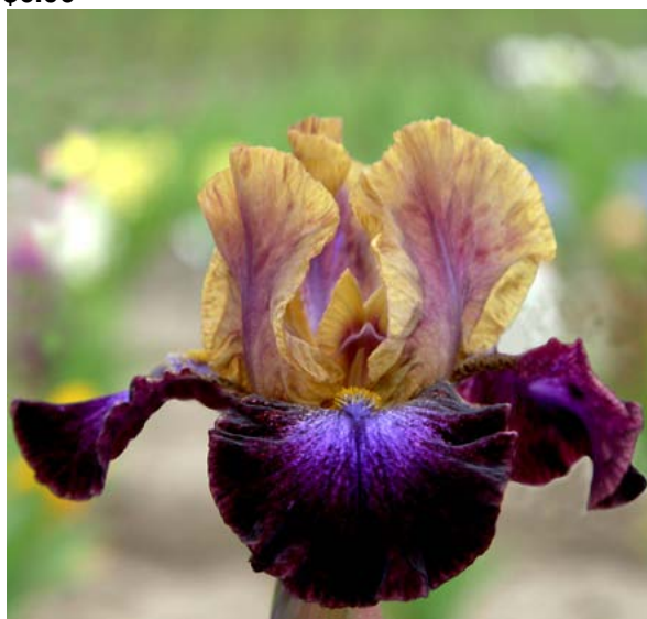
parting glances (Black 09) Healthy, colorful clumps filled with stalks. $5.50