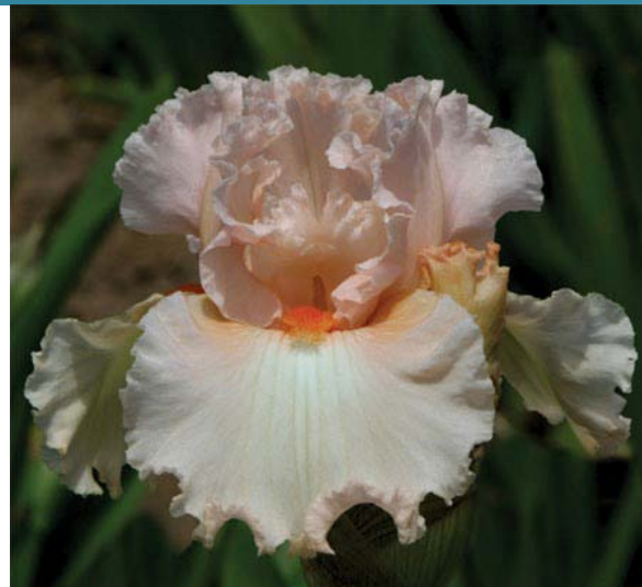
ballerina pink (Black 10) Ruffled & laced. Super growth. Magnificent show stalks. $11.00