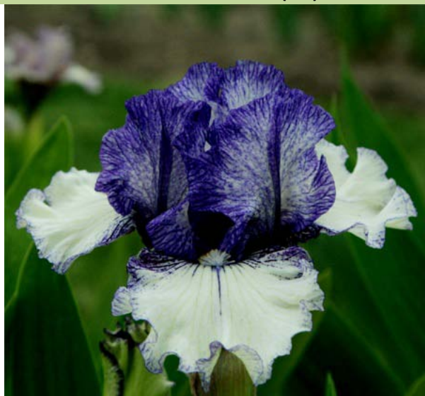
presto change-o (Black 09) White with dark violet blue plicata standards and fall hafts. Very showy. Prolific bloom. $5.50