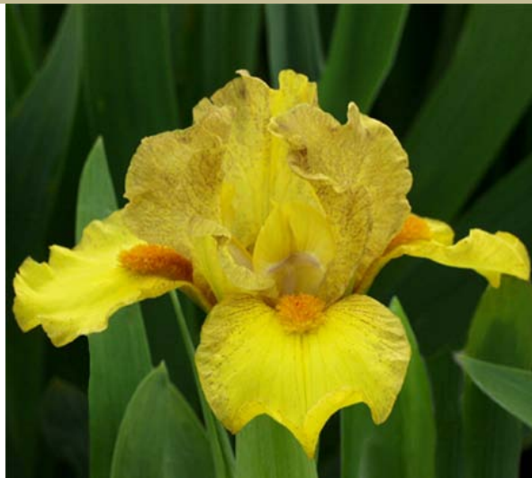
intergalactic (Black 08) Canary yellow with light brown plicata markings. Makes a very bright and cheery clump. $4.00