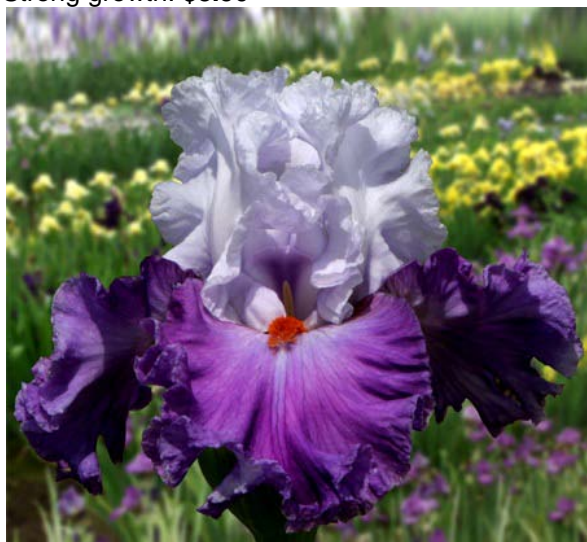
polka (T. Johnson 09) Big, ruffled, laced and beautiful. Palest violet standards. Mid orchid falls with paler bluish blush around vibrant red orange beards. Show stalks. $11.00