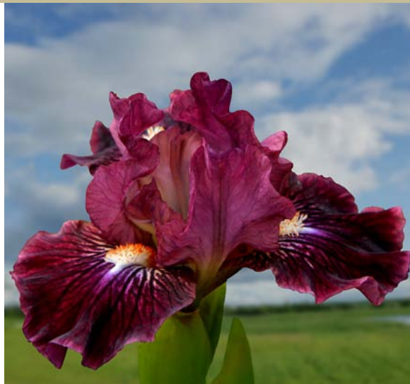
raspberry tiger (Black 09) Dark raspberry bitone, falls veined black. Orange over white beards. Superb parent giving a wide assortment of colors & dramatic veining in falls. $5.00