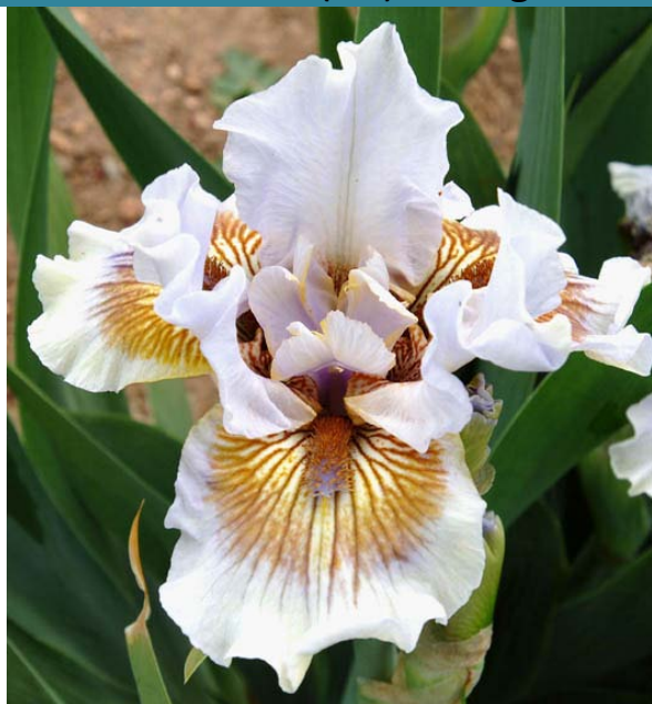
bonjour (Baumunk 08)

Palest violet with big auburn sunburst around sienna beards. $5.00