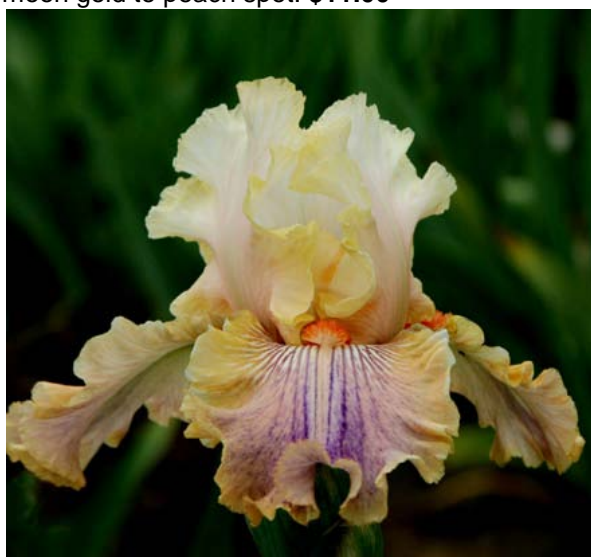
carnival of color (Black 09) White standards blushed pink and rimmed gold. Pink falls washed and lined purple. Golden hafts and band. Orange beards. $11.00