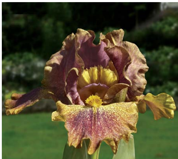
looney (T.Johnson 07) Brassy gold marked and washed dark wine-rose overall. Gold hafts, beards and style arms. $4.00