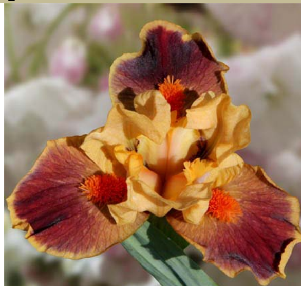
color blind (T.Johnson10) Very bright, hot colors. Excellent garden color. $6.00