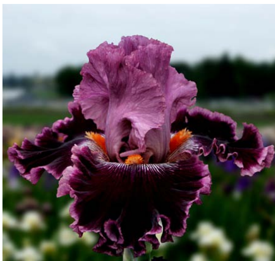
fashion diva (T.Johnson 09) Mid dusky rose standards and band on plush dark wine falls. Big flowers. $12.00