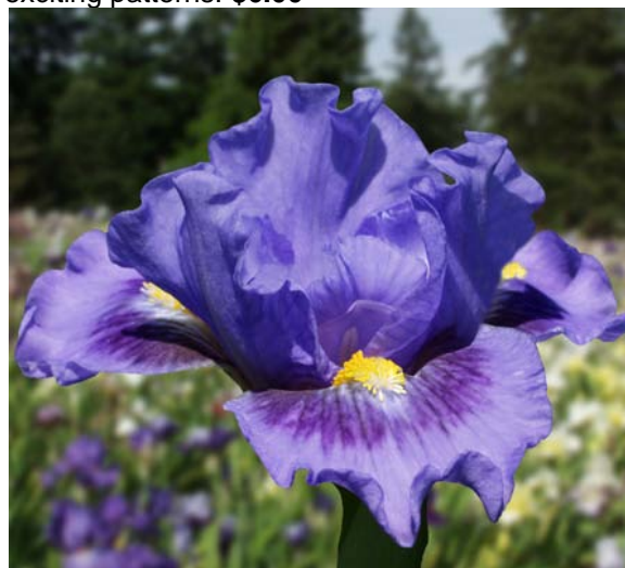
meow (Black 08) Mid lavender blue with darker red violet spot. Good parent for greens. $5.00