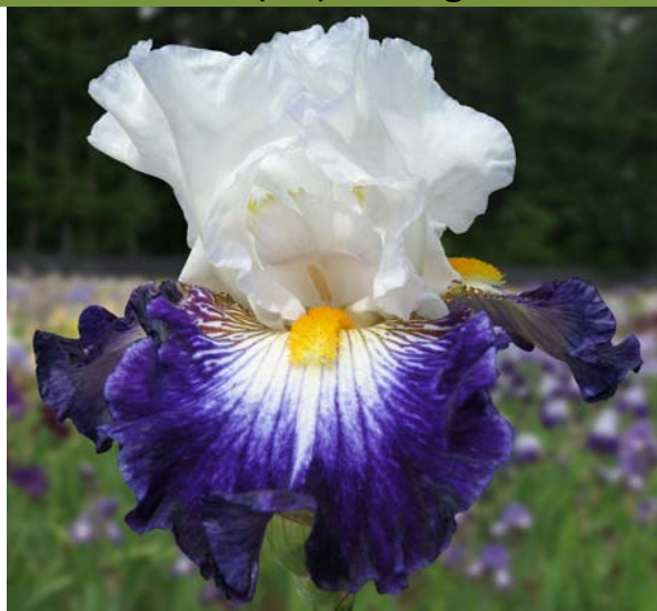
flash of light (T.Johnson 08) Bright white standards and large sunburst on dark violet blue falls. Yellow beards. Strong clean growth. Show stalks. Very popular. $8.50