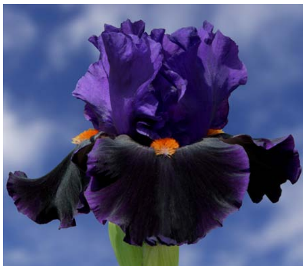
crete (T.Johnson 08) Deep purple standards and band on black falls. Orange beards. Show stalks. Superb. $8.50