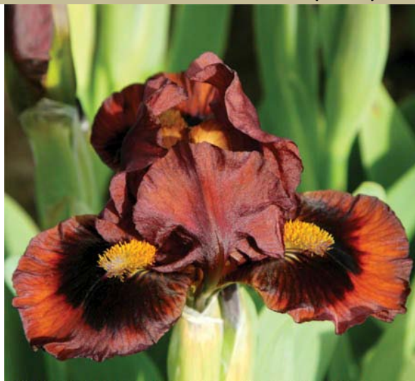
nosferatu (Black 10) Amazing glowing and sunfast color. A favorite with garden visitors every year. $6.00