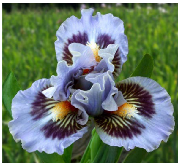
eye of sauron (Black 09) Lovely round form. Uniquely wonderful. Use to get greens. $5.00