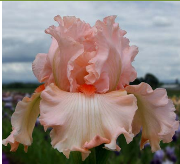
love me true (T. Johnson 08) Lovely ruffled clear mid pink with paler fall centers. Strong growth. $8.50