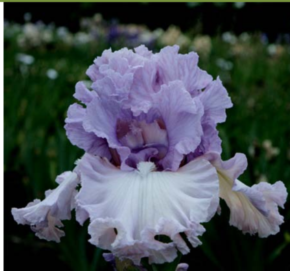
magical moment (Black 09) Light mauve pink standards. Milk glass white falls blend to pale lilac margins. $11.00