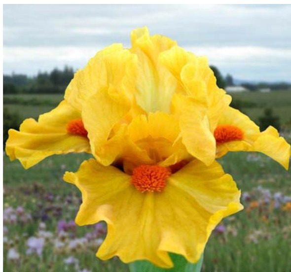
orange smash (T. Johnson 10) Huge, showy beards appear as if carved from wax. You can't ignore it! $6.00