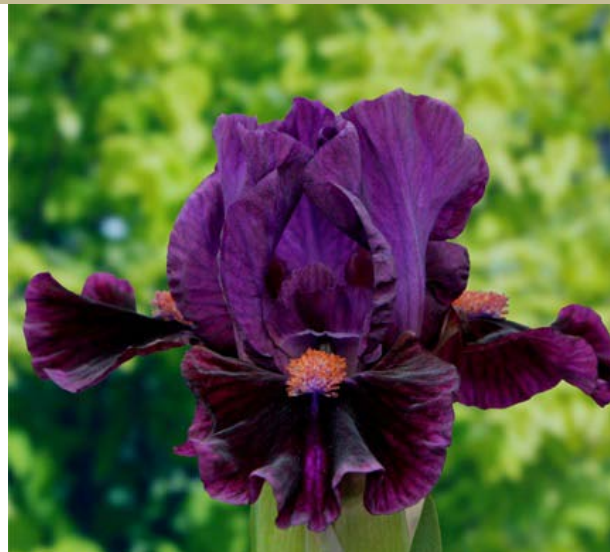
fidget (T.Johnson 09)

Buff gold with large, glowing garnet fall spots and orange beards. Makes very showy clumps! Fast and easy growth. Top HM and Walther Cup 2010. $5.00