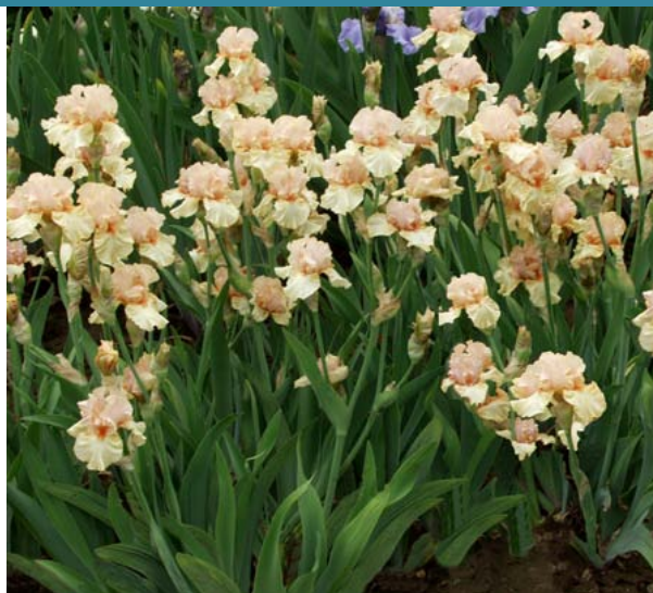
bundle of love (Black 07)

Palest violet with big auburn sunburst around sienna beards. $5.00