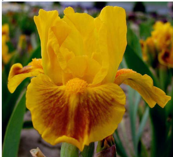
gold digger (T.Johnson 09)

Dark black cherry bitone. Interesting big violet and orange beards. Super substance. $5.50