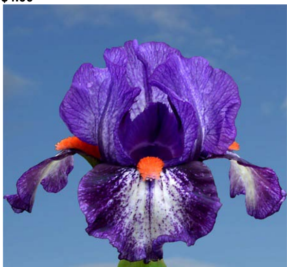
electrifying (Black 09) Extremely showy clumps. Stalks at upper height of SDB class $6.00