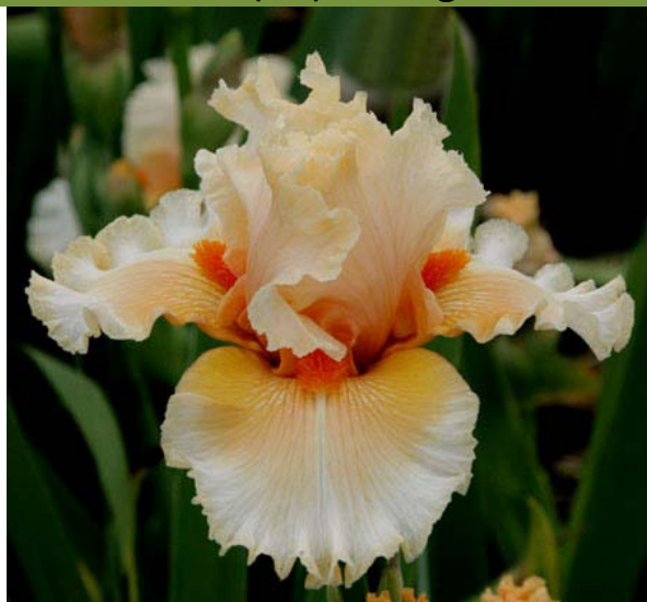
all my dreams (Black 09) Luscious peach standards. White falls with big half-moon gold to peach spot. $11.00