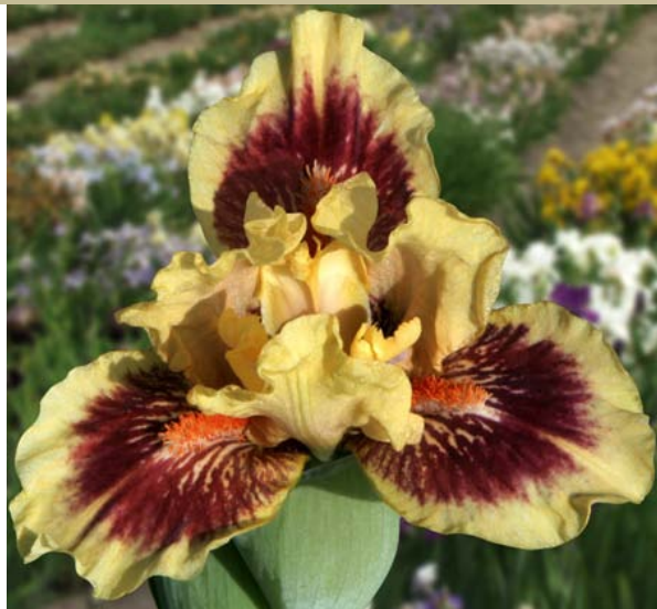
eye of the tiger . (Black 08)

Buff gold with large, glowing garnet fall spots and orange beards. Makes very showy clumps! Fast and easy growth. Top HM and Walther Cup 2010. $5.00