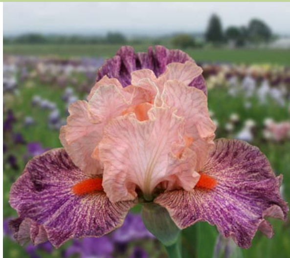
frisky frolic (Black 08) Bright bicolor plicata with great carrying power. $5.00