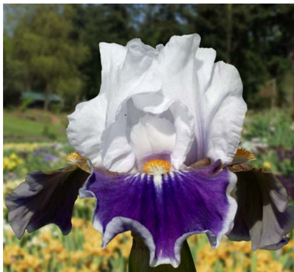
dazzling (Black 08) Nicely branched. Fabulous color. Popular. Top HM 2010. Fertile. Sibling to Man's Best Friend. $5.00