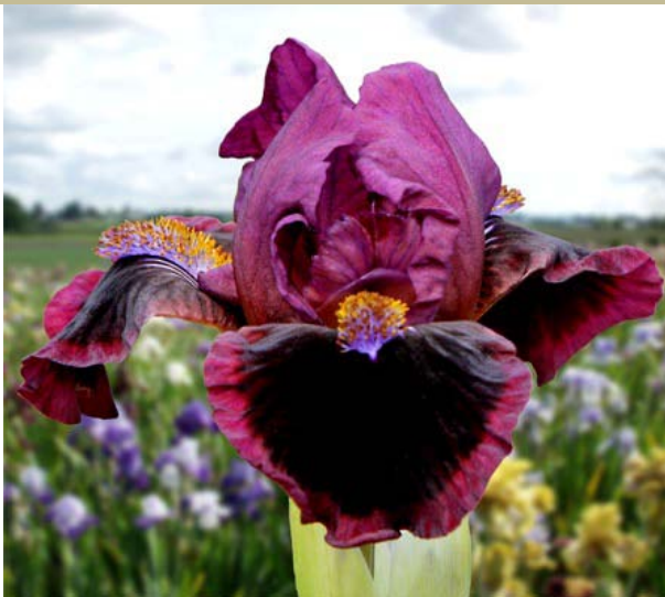
stunt double (T.Johnson 09) Beetroot standards and band on red black falls. $5.00