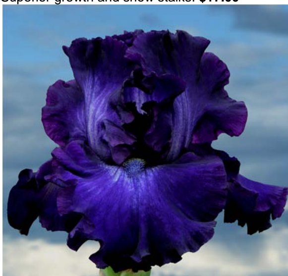
circle of light (Black 09) Dark indigo showing confined white plicata ground in standard and fall centers. $11.00