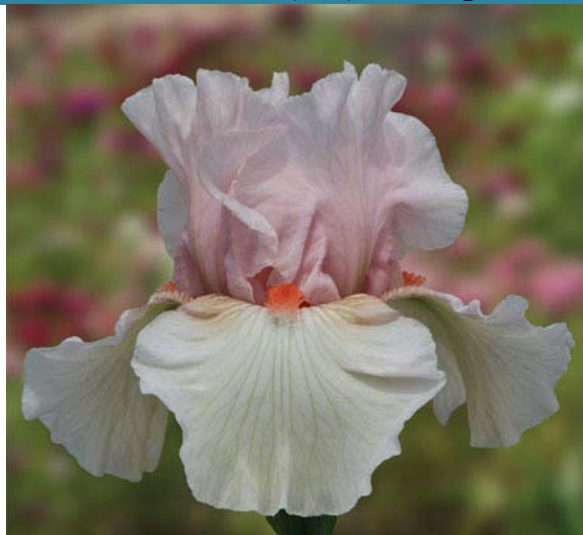
always lovely (Black 10) Strong, clean growth. Clumps filled with show branched stalks. Perfect parent for IBs and BBs $9.00