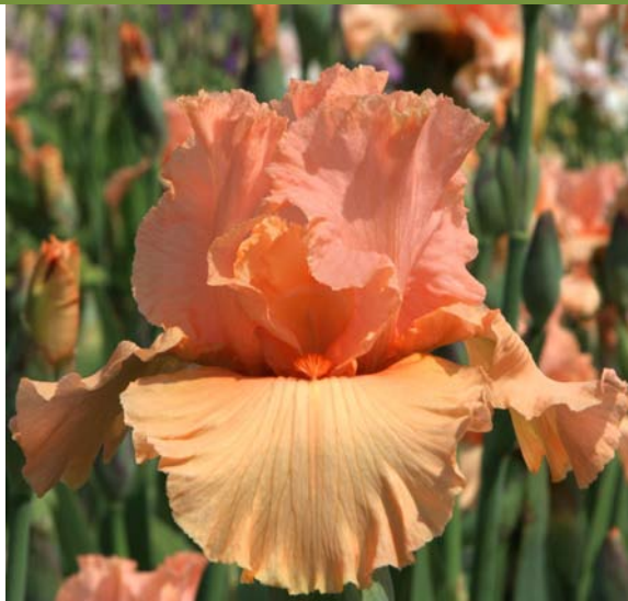
coral splendor (Black 08) Luscious coral pink standards and coral peach falls. Fabulous stalks and clumps. $9.00