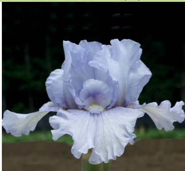
alberta clipper (Black 07) Classy, icy white flowers carried on show stalks. Superb parent for IBs, BBs & MTBs. Fertile both ways. Classy! $5.00