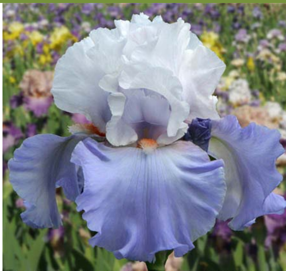
calgary (T.Johnson 10) Blue white standards tinted pink. Mid blue falls. Superior growth and show stalks. $17.00