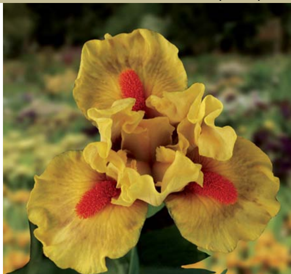
clever (T.Johnson 07) Big orange beards add pizzazz. Super parent. $4.00