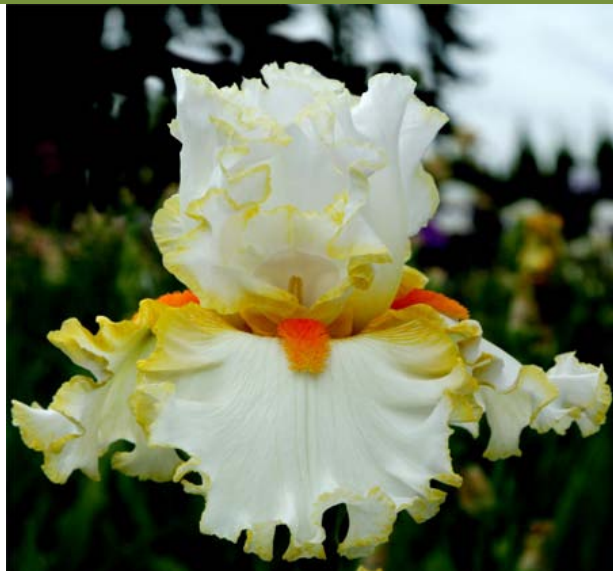
stolen sweets (Black 09)

White with bright yellow hafts and lacy edges. Neon orange beards. Nice fragrance. $11.00