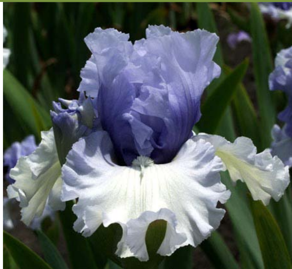
cloudscape (Black 08) Mid blue to light blue standards. Icy white falls. Classy flowers on fabulous show stalks. $8.50