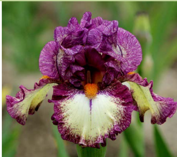
intoxicating (Black 09) Gorgeous form. Superb show stalks with 3 branches. Fertile both ways. An awesome parent. $6.00