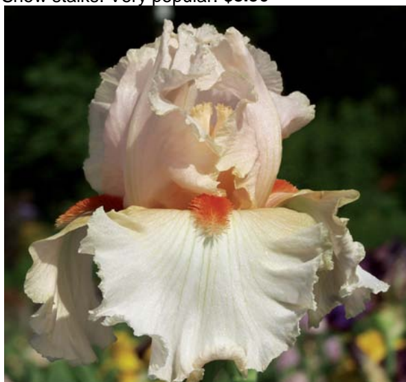
guilt free sample (Black 07) Nicely laced. Peach standards and hafts on white falls. Vigorous. Show stalks. $5.50.0