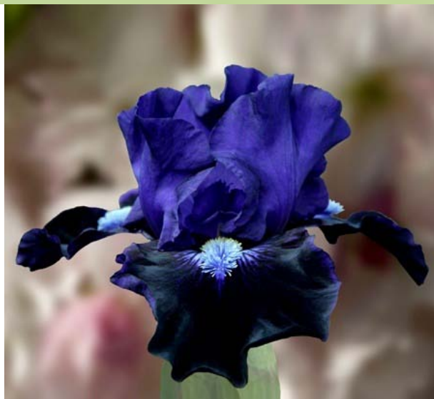
star in the night (Black 09) Stunning black bitone with blue white beards. Healthy clumps filled with stalks. $6.00