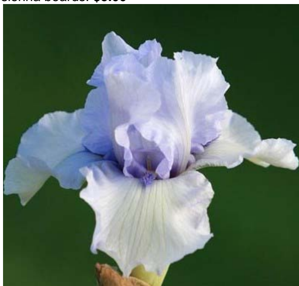
hoodoo blues (S. Markham 08)

Show stalks supreme! An exceptionally fine parent giving quality seedlings in all bearded classes. Top BB HM and Walther Cup 2009. A MUST HAVE! $4.00