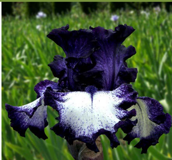
grapetizer (T.Johnson 09) Dark purple black standards and plicata band on stark white falls. Very showy. $11.00