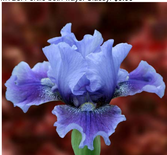
date with destiny (Black 09) SPECIES - X Mid blue standards and margin on red violet falls. Barely taller than an SDB at 18" (46 cm). Well branched stalks have 3 branches and 7-11 buds. Foliage stays short beneath the flowers. Derived from very diverse background of SDB, IB, tet MTB and TBs. Nice plicata heritage too. It is fully fertile both ways. $8.50