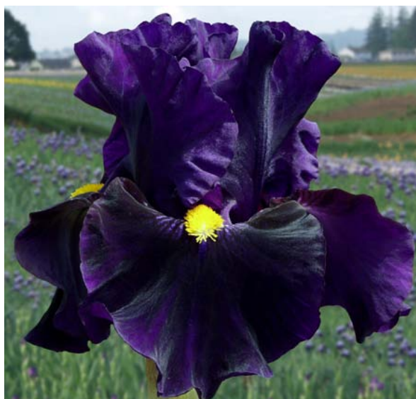
lady of the night (Black 08)

Ruffled pale blue with striking dark blue beards. $5.50