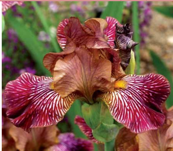
redrock princess (Witt 06)

Cinnamon standards. Garnet falls boldly striped white. Top AM 2010. Outstanding! $4.00