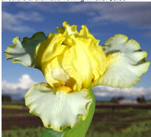
sweet and innocent (T.Johnson 10) Sparkling clean glaciata. Clear yellow standards & narrow band on white falls. Very feminine touch. $6.00