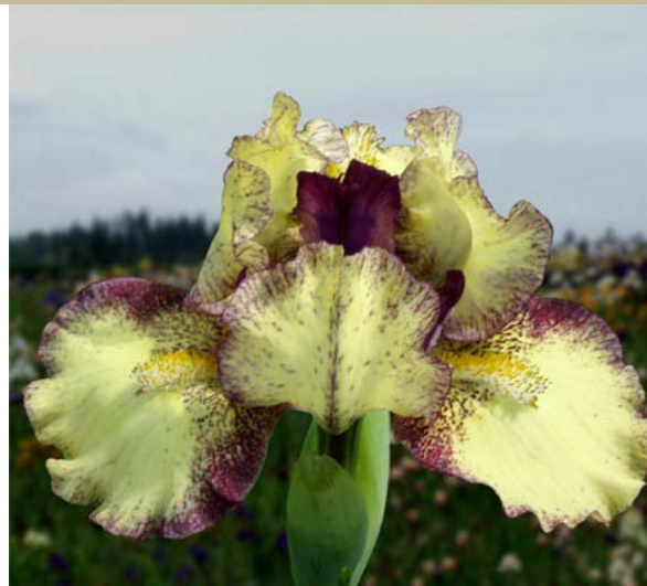
kaching (Black 09) Light yellow with burgundy plicata markings & style arms. Unique! Fabulous parent for form, color & exciting patterns. $6.00