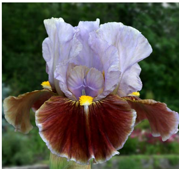
man's best friend (Black 08) Spectacular clumps. Well branched show stalks. Fertile both ways. A must have. Second highest HM 2010. $5.00