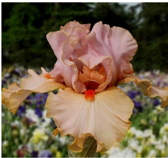
inspired (Black 09) Dusky rose standards. Apricot falls with red orange beards. Smaller flowers. Abundant stalks. $11.00